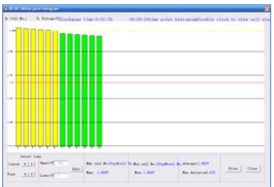
K-3980 PC Software