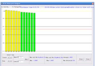
K-3980 PC Software